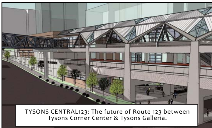
TYSONS CENTRAL123: The future of Route 123 between Tysons Corner Center & Tysons Galleria.

To set up a briefing for your homeowners association, civic group or business, please email outreach@dullesmetro.com or call (703) 448-5550.