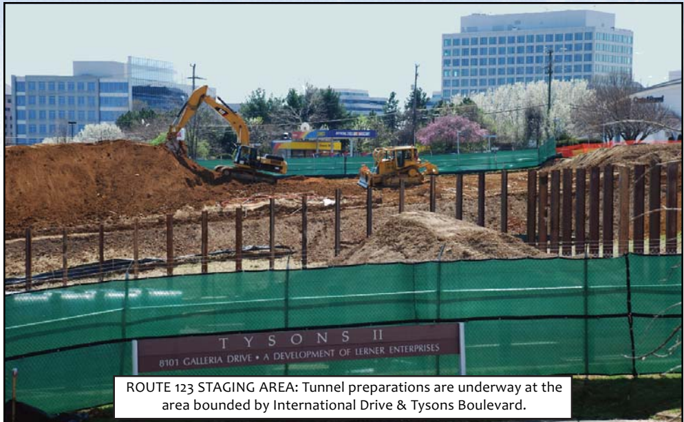
ROUTE 123 STAGING AREA: Tunnel preparations are underway at the area bounded by International Drive & Tysons Boulevard.

For information on station designs and locations, visit www.dullesmetro.com .