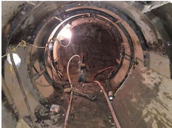
This equipment, similar to a jackhammer, is used by construction crew to break through the incredibly dense rock along the Silver Line Phase 2 route.

for eight or more hours every day," Kearney said. Further, it's a job the public cannot see and therefore cannot appreciate.