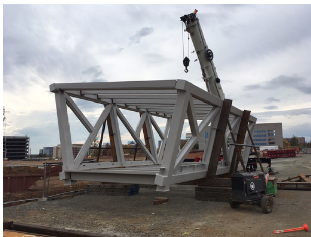
The first span for the pedestrian bridge has been delivered to Innovation Center south.