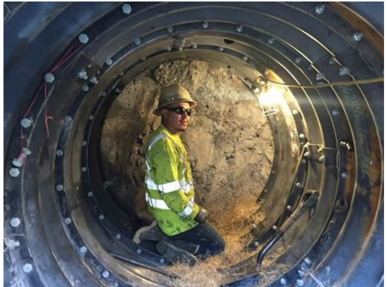
A CRC worker kneels in the tunnel where he is hand mining to carry utilities to and from the Silver Line Phase 2.