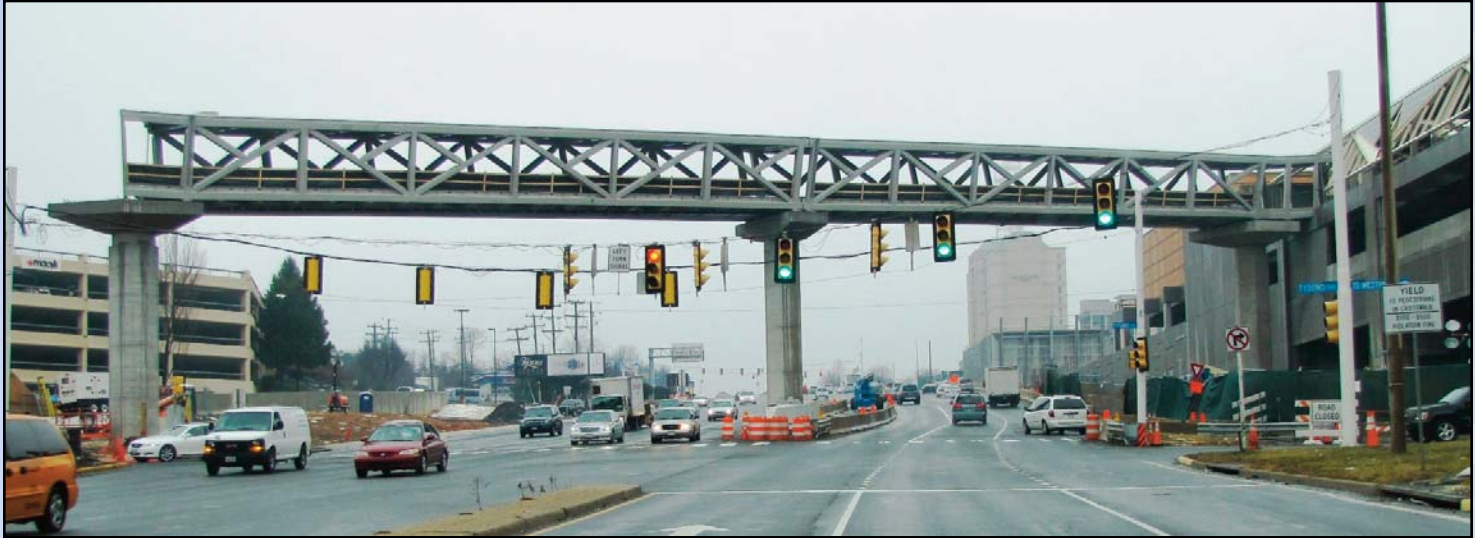
BRIDGING ROUTE 123: Segments of the pedestrian bridge from the Tysons Corner Metrorail Station across Route 123 will eventually connect to a pedestrian pavilion on the Tysons Corner Center site.