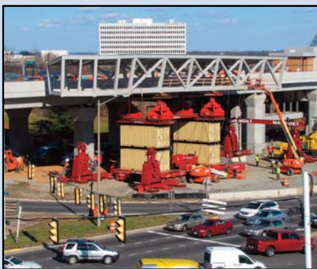
READY TO GO UP: Crews prepare for placement of pedestrian bridge segments at the Tysons Corner Station.