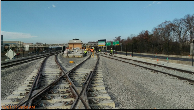
Workers set crossover switch at Innovation Center Station.

Silver Line construction contractors meandered through the below-freezing, near record-low temperatures along with snow and ice, and are looking toward some busy months as Phase 2 work continues from the Wiehle-Reston East Metro station to the end of the line in Ashburn.