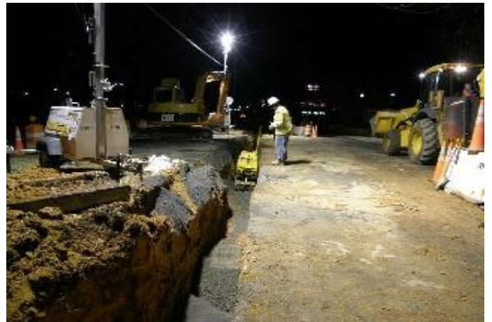
Utility Relocation crews work day and night to improve Tysons Corner